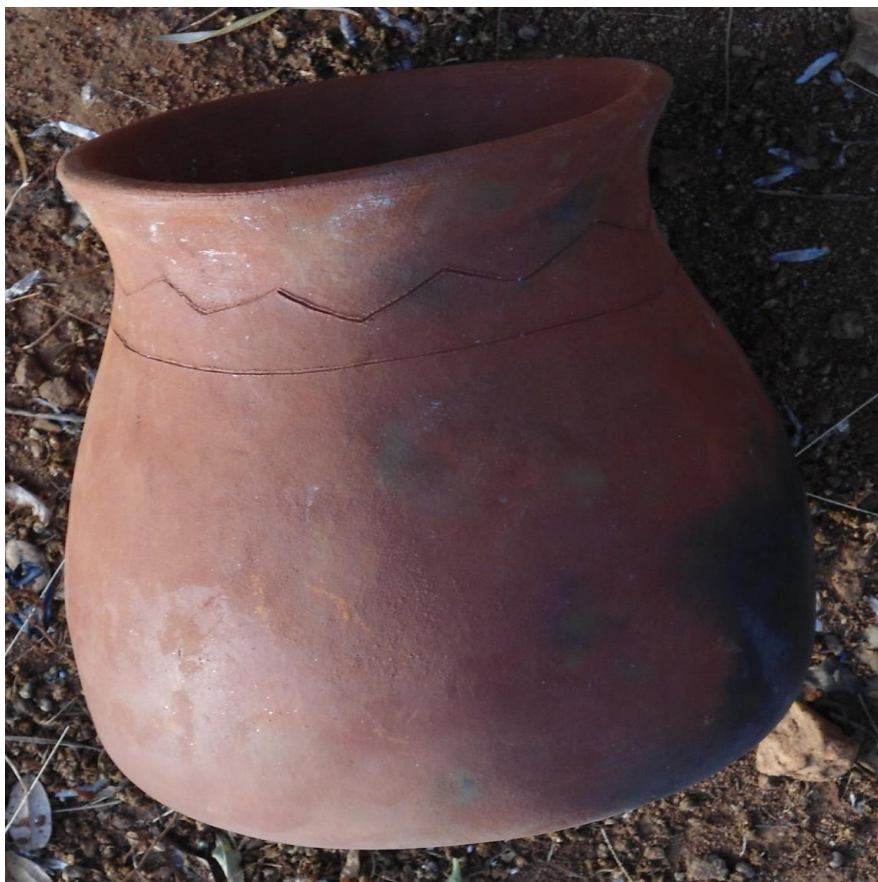
Figure 6: Zigzag line decoration on a pot