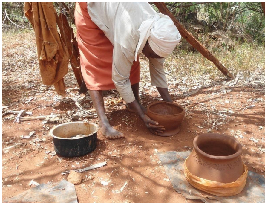
Figure 4: a potter engaged in pot forming

Where decorations are necessary, they are incised using a piece of stick or a broken piece of calabash. The decorations consist of simple horizontal rows of dots/lines, grooved horizontal zigzag or wavy lines confined to or just below the neck of the pot. 38 Decorations are also applied using different colours especially for pots meant for use as flower vases, see Figures 7 and 8 below.