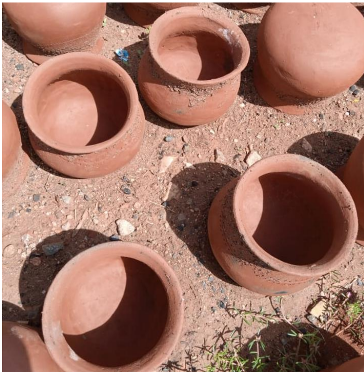
Figure 10: wide-mouthed pots