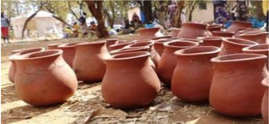
Figure 9: Pots for sale at Ishiara market

heat loss. Once ready, the women hawk the pots around the village or take them to Ishiara market. 40