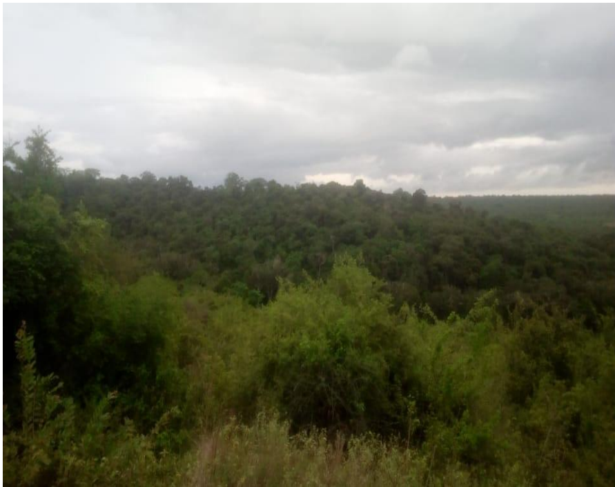
Figure 1: An image of kaya Kauma in Kilifi County. It is listed as a World Heritage Site.

covering an area of about 4,000 acres and representing ‘some of the few patches of undisturbed vegetation in an increasingly densely-populated landscape.’ 19 Today, the Mijikenda are found in Kilifi, Kwale and Mombasa counties. There are however no kayas in Mombasa County. Kwale County is home to the Digo and Duruma sub-communities while Kilifi County has the other 7 Mijikenda sub-communities. The study focused on Kilifi County since it has some of the best-managed kayas and there is strong adherence to cultural traditions. Moreover, most of the Kilifi kayas are on the World Heritage listing whereas in Kwale it is only the Duruma kayas that are listed.