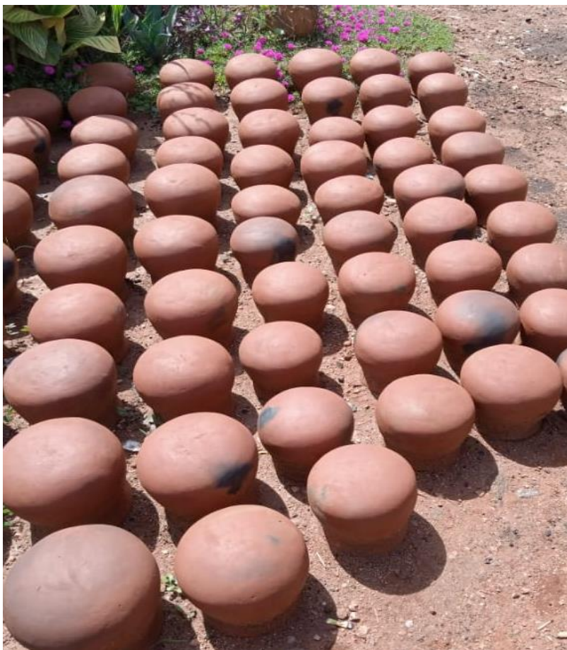
Figure 11: pots with a rounded or cylindrical bases