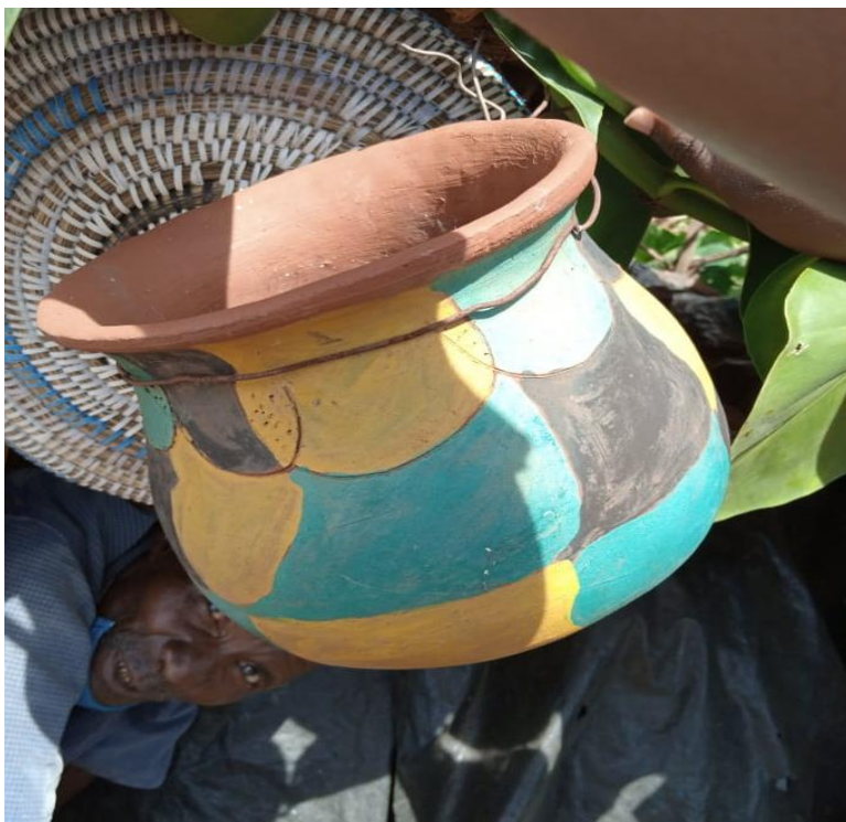
Figure 8: Colour decorations on a pot meant for use either as a flower vase or a house decoration

Thereafter, the vessel is dried under a shade, away from direct sunlight for about 5 days to remove water that is mechanically combined with clay particles. 39 Direct sunlight is avoided since rapid drying due to high temperatures can cause cracks. After the initial drying, the pot is dried directly under the sun. The duration for direct drying varies depending on the size and relative humidity. When dry, the pots are baked hard by firing them under high temperatures. To ensure even and/or controlled firing, firing is usually done late in the evening when the wind is not blowing. Thereafter, they allow the pots to cool before pulling them out from the fire using tongs thus preventing cracking through rapid