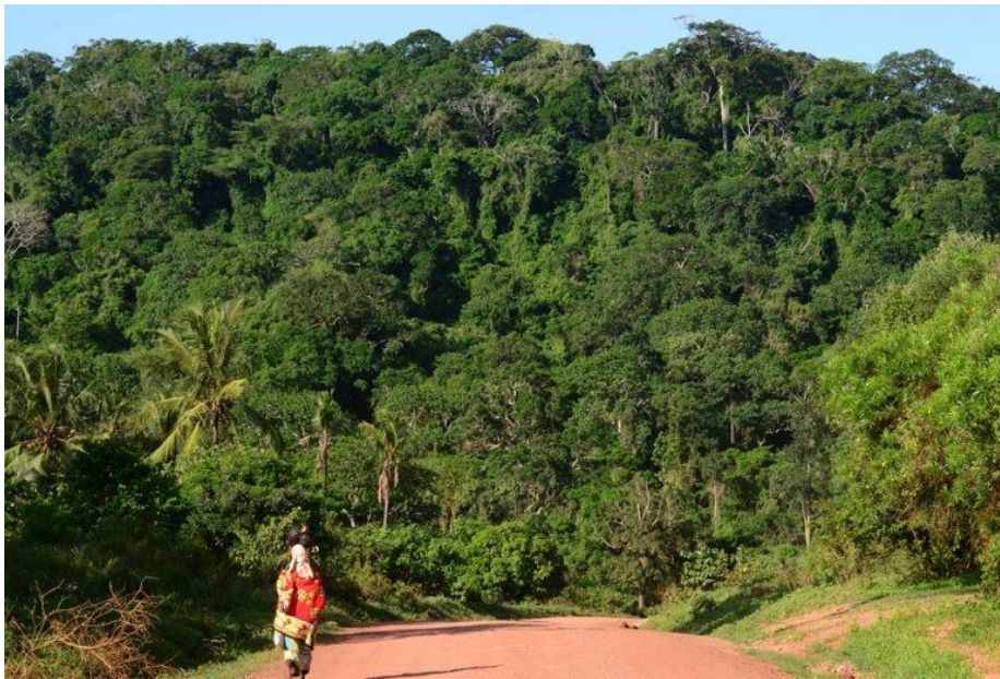
Figure 2: An image of kaya Kambe in Kilifi County. It is also listed as a World Heritage Site.

Over time, the kaya elders have developed a system for protecting their TK and forests. Under that system, the elders are viewed as custodians, with the responsibility for regulating access, use and control of resources (including TK) in accordance with customary laws (including rites and taboos) and enforcing them. Through taboos, for instance, they regulate who can access the forests, when, how and for what reasons. For example, it is a taboo to enter; bring flames; fence; or cut trees in the kaya without the consent of the elders. 20