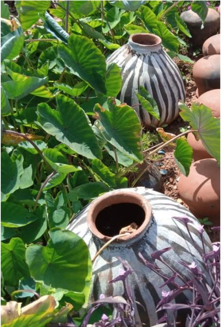
Figure 7: A flower vase decorated using black and white colour paint