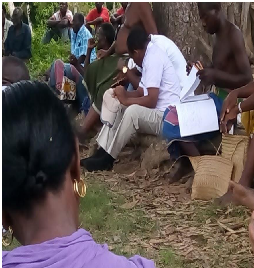
Figure 3: The researcher (holding a cap) attended a customary court session on 26 th April 2018 at Mwembe Marunga where Rabai elders sit (under a mango tree) to hear and determine disputes touching on land, adultery, witchcraft, marital and family disputes every Monday and Wednesday among locals.

There are collaborations between kaya elders and governmental and non-governmental agencies to protect their TK and resources. 27 For example, some kaya forests are World Heritage Sites 28 and are under the management of the